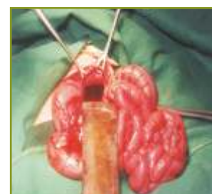
Congenital Diaphragmatic Hernia