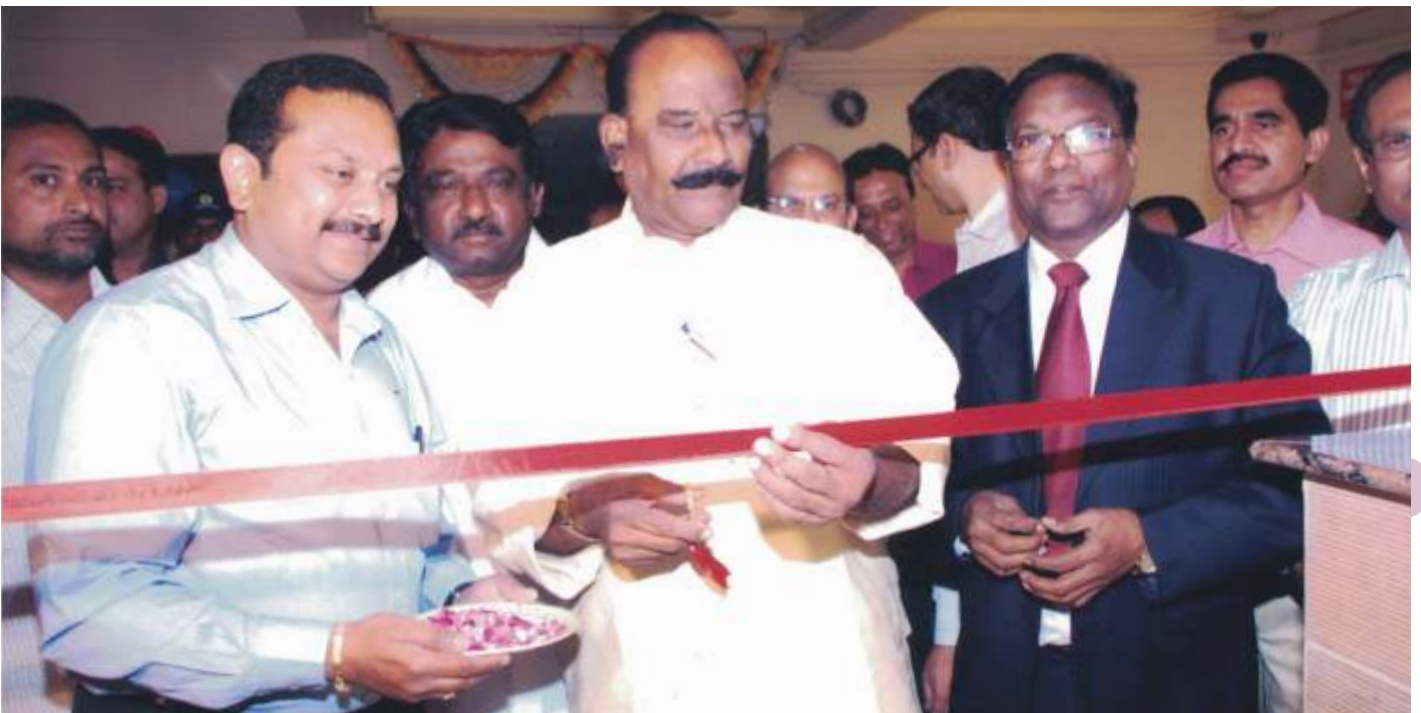
Inauguration of New Block on 6th March 2011